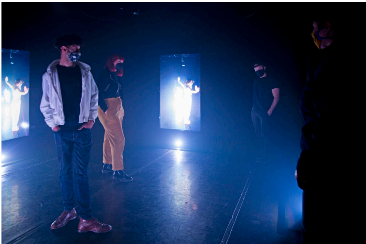
“Are:era” by Pseuda at CounterPulse in San Francisco, part of Combustible Residency 2021.

person? What distinct qualities would I get out of each separate medium, and what experiences would hold true across both?